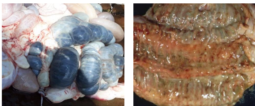
Figure 3. Gross lesions of swine dysentery

A. Swelling of the large intestine; B. The mucosa of the colon is covered with mucus and blood