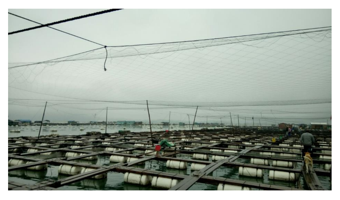
Figure 3. Floating sea cage culture of large yellow croaker (The photo was taken on January 28, 2018 in Xiapu City-Fujian Province-China)

floating sea cage, earthen pond, enclosure/seine net, storm-resistance deep-sea cage, indoor recirculation system, and the north-south connected farming model. Selecting the best system depends on the local geographic conditions, the economic resources of the anglers, and the scale of the project (Liu, 2013).