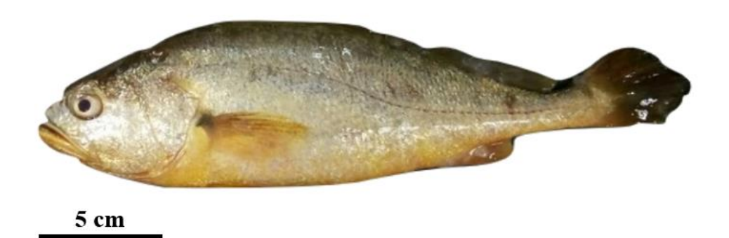
Figure 1. Large yellow croaker ( Pseudosciaena crocea ). The photo was taken on January 31, 2018 in a laboratory of the University of Shanghai for Science and Technology, Shanghai-China